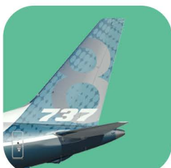
737 NG / Classic