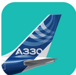
A330 CEO Family