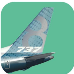
737 NG / Classic