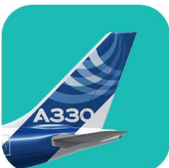
A330 CEO Family