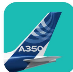
A350 XWB Family