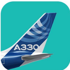
A330 CEO Family