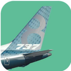
737 NG / Classic