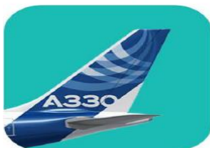
A330 CEO Family