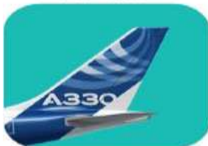
A330 CEO Family