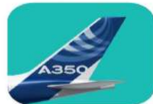
A350 XWB Family