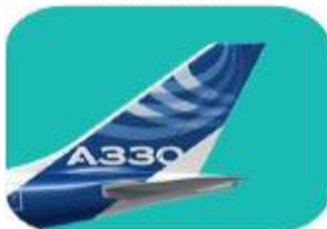
A330 CEO Family