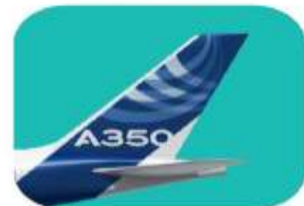
A350 XWB Family