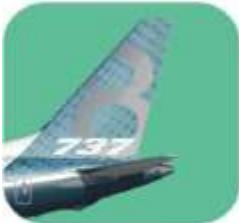
737 NG / Classic