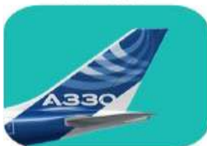
A330 CEO Family