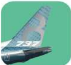
737 NG / Classic