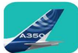
A350 XWB Family