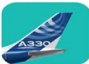
A330 CEO Family