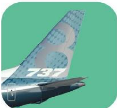
737 NG / Classic