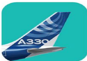
A330 CEO Family